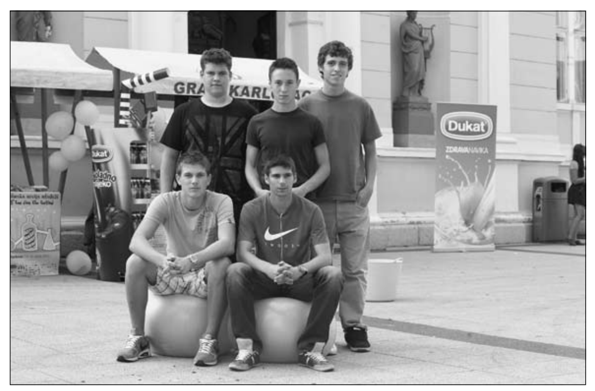
THE WINNING TEAM. All for one and one for all.

the serenity and tranquillity on the antries. We have only one rule regreen landscapes of Muljava. For garding our little excursion - all those who like outdoor activities activities come to halt the minute we have organised horseback rid- the food is served. (sv)