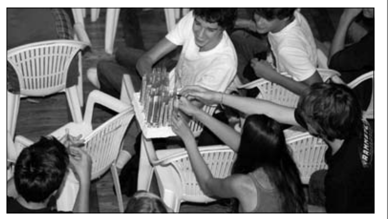
CHEERS! An appropriate toast. Chocolate milk served in test tubes.

While we were contemplating possible film titles to be shown this winter in Karlovac, our technicians proved to us once again why they were the ones chosen for that partic-