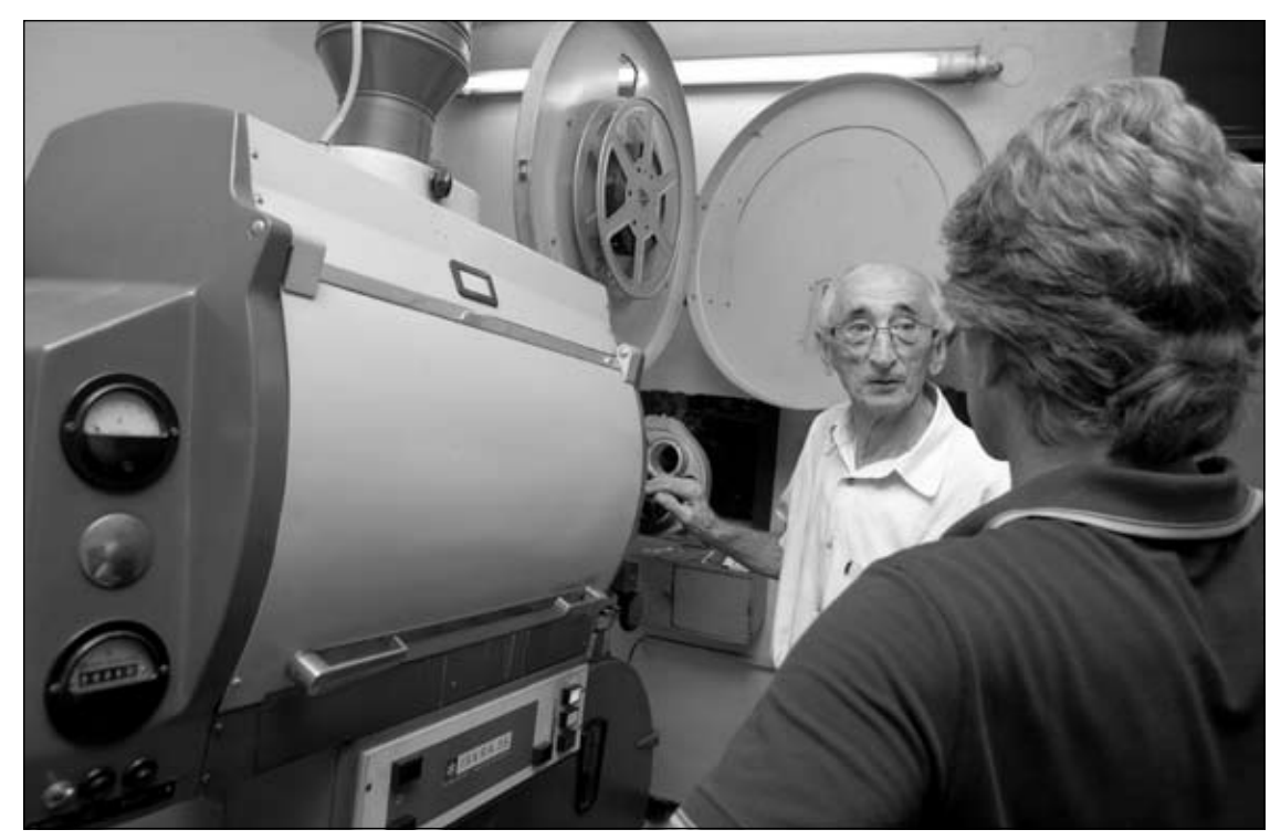
AFTER YEARS WITHOUT USE. Film reel has been set up and projectors are running again.

Since the equipment for projection did nothing but sat around and collected dust in Edison for a number of years, a gentle but an experienced hand is needed to get it going again.