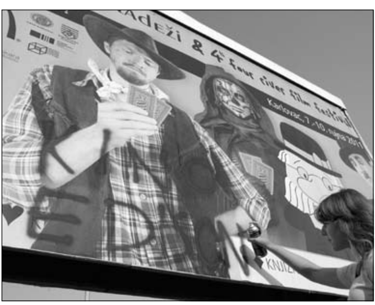
SURPRISE. Edison was the secret location almost until the beginning of the Festival.

e are proud to announce that the fourth festival's location has been secured, and that all the citizens who were present at the time of the operation emerged from it unscarred. Since the mere thought of mentioning the Edison Cinema has become a taboo, one is under constant pressure not to talk about it before dinner or breakfast- to avoid any possibilities of an upset stomach and quite possibly that of mass hysteria. Regardless of the possible consequences, but with high hopes of achieving a positive reaction, the Festival decided to reveal its fourth location at the dawn of a beautiful day, just hours before the grand opening. Naturally, this announcement was done in a way not fitting for the eyes of our gentle citizens. Namely, a group of blackguard brigands wrote the name of the location in gigantic, red letters all over the posters thus urging our gentle and conscious citizen to call the police instead of 112 (911).