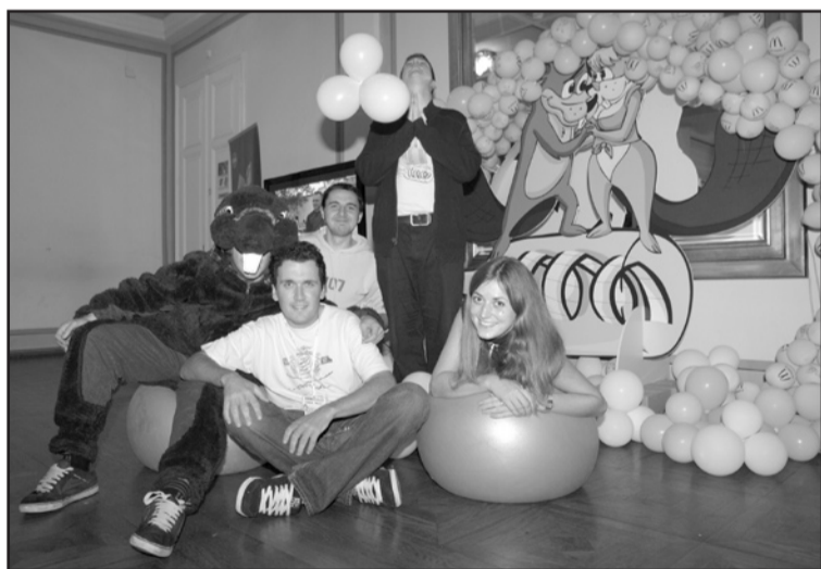
BOTTLE DAILY STAFF. Always with you (even when you don't know it).

They are always one step behind you, listening carefully even when the dictaphones are switched off, and the no flash and camera signs are on. Once you become aware of their presence it is usually always too late, and you get to see a very unfortunate picture featuring Mr Beaver at the front page of the Daily Bottle. The newsletter's statute consists of one and one rule only- until the news is featured in the Daily Bottle it is as if it never happened and all of the similarities with the tabloids is accidental. Our team who writes stories filled with a positive vibe, creates daily newspaper celebrities and anti celebrities and worships the beaver 100% per cent, has one mission and one mission only- yes to (anti)newsletter, yes to (anti)Festival! Brackets read as needed.