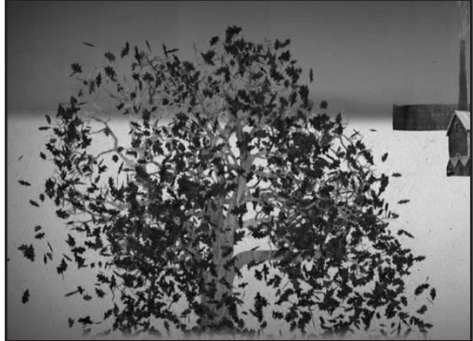
STANI I PODIJELI / STAND AND STARE Electric December 2008 - Europa Cinemas Network, eShed.net (UK)