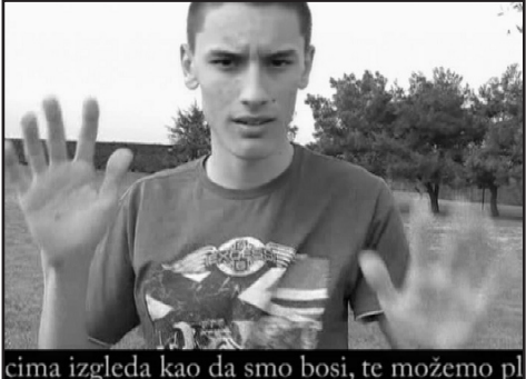
SHOPPING TV - INVISIBLE OPANAKS Studio kreativnih ideja Gunja, Gunja