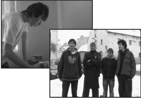
A FILM ABOUT TOBO Kinoklub Karlovac, Karlovac NO WOMAN NO CRY "Semper in motu", Osijek