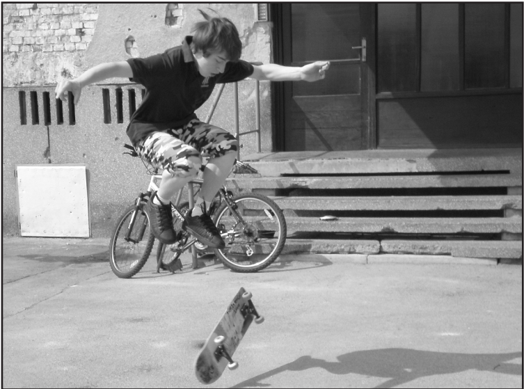
A FILM ABOUT TOBO Kinoklub Karlovac, Karlovac