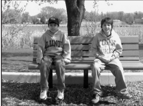
DUH U BOCI / GENIE IN A BOTTLE International Youth Media Summit